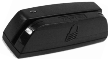
Dynamag Encrypted Card Reader Magtek Series