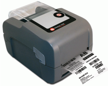
Desktop Thermal Label Printer Datamax