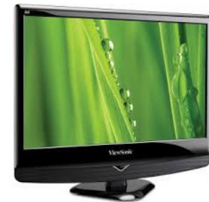
Wink Value Monitors