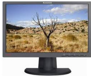
Wink Premium Monitors