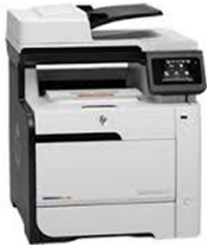
HP: Laserjet Color MFP