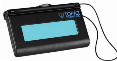
Electronic Signature Pad Topaz Signature Lite