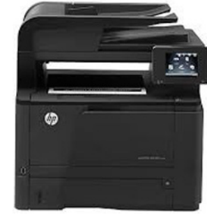
HP: LaserJet B&W MFP