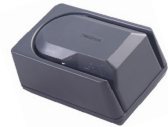
Magtek Mini Check Reader Small footprint. Durable. Accurate.