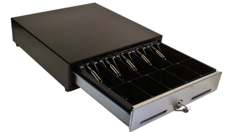
USB Cash Drawer