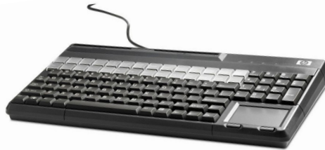
HP: Keyboard +Mouse +Card Reader Non-Encrypted SmartBuy POS Keyboard