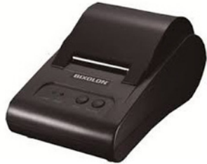
Samsung Receipt Printer Bixolon