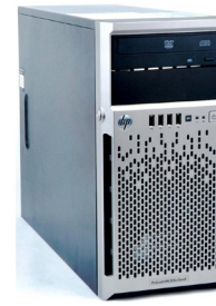
HP Small Business Server 1yr on site hardware support: INCLUDED (North America only)

Price: $1,800 + $350 setup (Purchase) Price: $400-600/month (Hosted Rental)