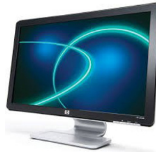
Wink Recommended Monitors