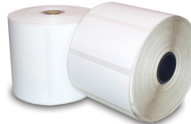
Mailing Labels / Exam Labels