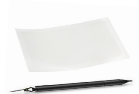
Accessories for Topaz Signature Pads Topaz Signature Lite