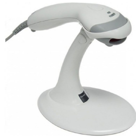
Honeywell Barcode Scanner Trusted by thousands!

Price: $199.99 (Wired) Price: $489.99 (Wireless)