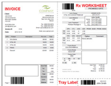
Invoice Paper & Rx Worksheet Paper 1,000 Sheets

Wink Labels for your Datamax Printer One printer for all your label printing needs!